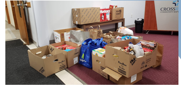
A collection of items for Hope Clinic. Our Christian Challenge and Youth prepare the items after collection.